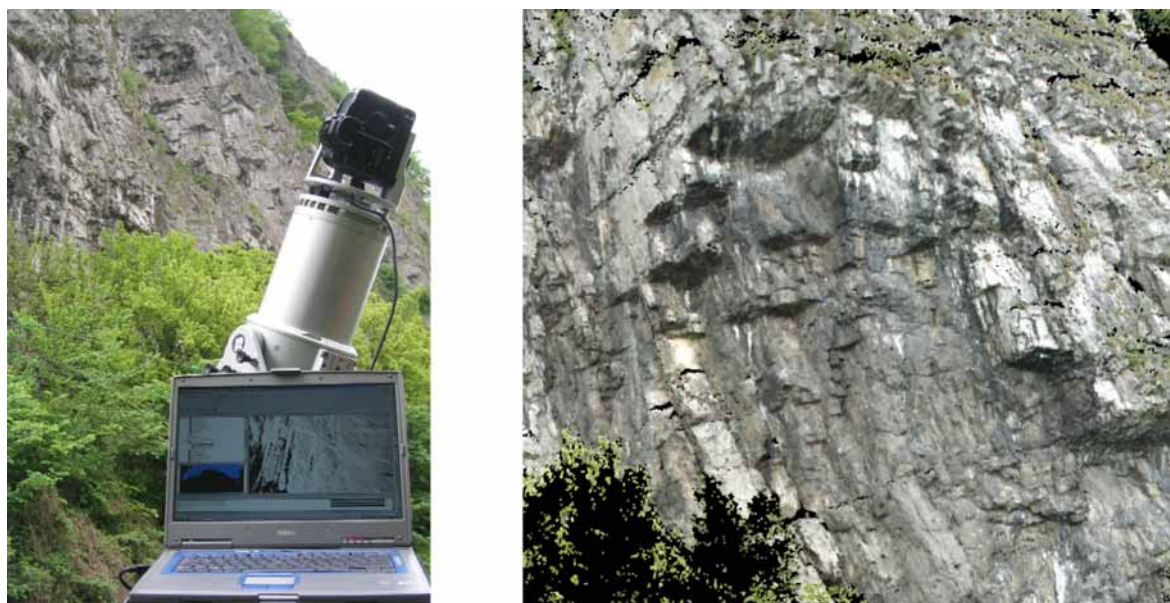
Figure 1. Laser scan survey set-up in the field, Dave (Belgium). The picture on the right shows a detail of the coloured 3D point cloud of the scanned rock face (note that this is not a photograph).

One of the most important advantages of the laser scan method is however, that a very high point density or resolution, in the order of 1 cm, can be achieved. A new generation of laser scanners also yield for each point the passive colour (i.e.: Red, Green, and Blue reflection values) based on simultaneous acquisition of high-resolution digital images with a (11 Mpixel) digital camera (Riegl, 2004) – see Figure 1.