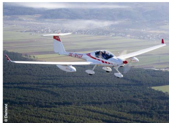
The Diamond Aircraft multi purpose platform fleet: DA42-MPP and HK36-MPP each equipped with RIEGL airborne laser scanners LMS-Q560