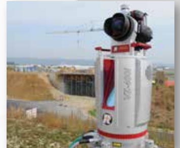
NIKON® DSLR camera for mobile and terrestrial applications