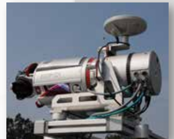
horizontal setup for, e.g. road surface scans

Seamless RIEGL workflow for MLS data acquisition, processing and adjustment is provided by RIEGL's proven software suite.