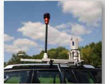
vertical scanner setup with additional panoramic camera system