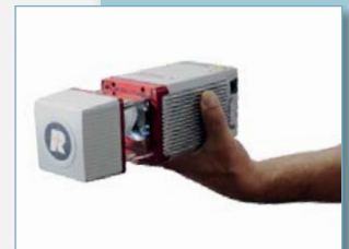
compact & lightweight miniVUX®-1UAV

Class 1 Laser Product according to IEC 60825-1:2014