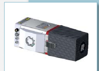
RIEGL miniVUX®-1UAV stand-alone with protective cap