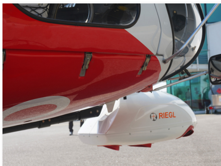
RIEGL's VQX-2 Helicopter Pod mounted to an Airbus Helicopters AS350.